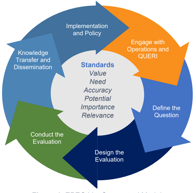
Figure 1. EPEC-Vet Conceptual Model

3. Employ state-of-the-art knowledge translation methods to effectively disseminate evaluation results to key VA stakeholders and broader policy and research communities, and to facilitate the use of new evidence into VA policies, programs, and practice.